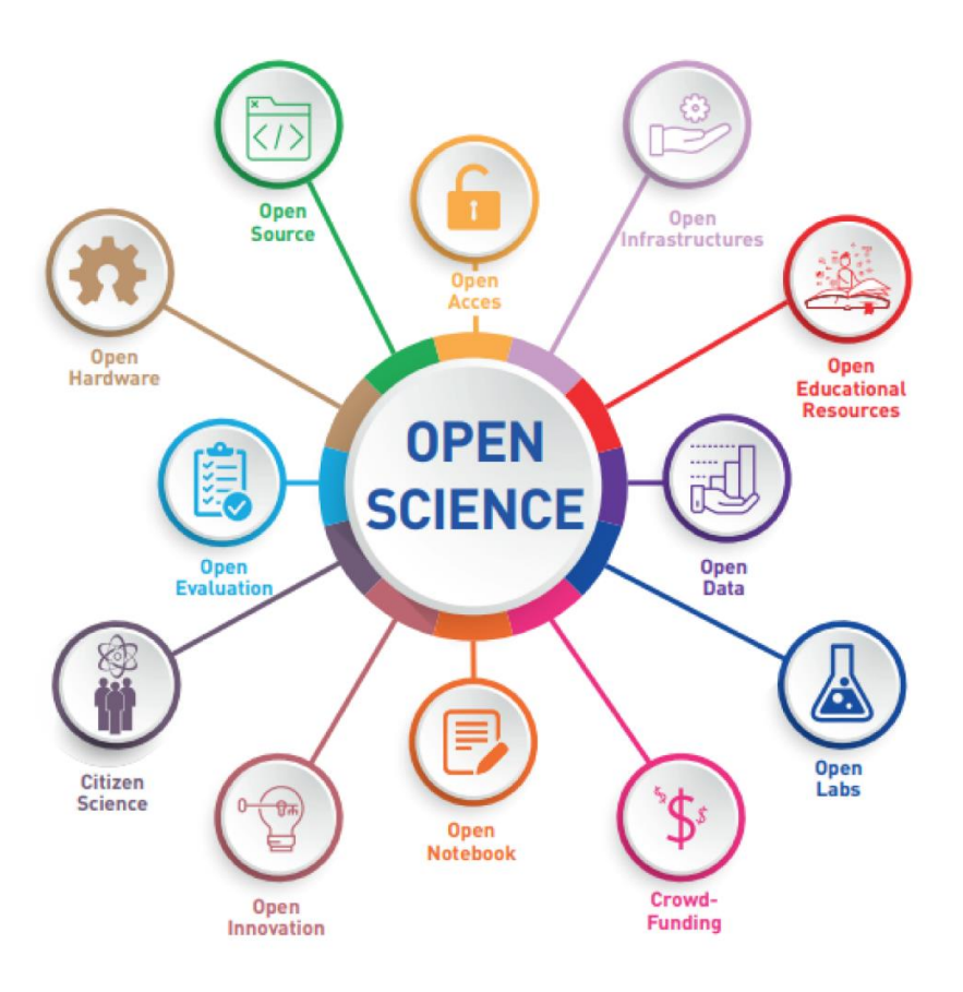
The Components of Open Science, UNESCO 2020<sup>2</sup>