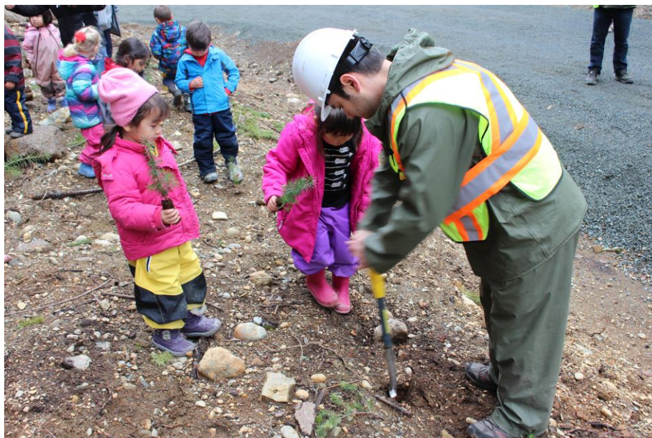
Snaw-naw-as children planting trees in the MABR in 2018.