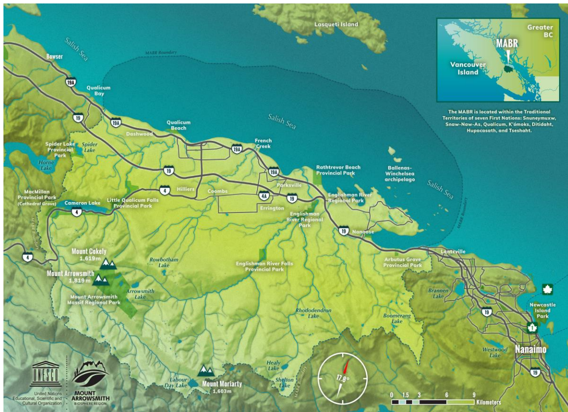
The location of the Mount Arrowsmith Biosphere Region.

determine if they wished to get involved 1 . During this time, the MABR Coordinator met with them often to discuss who was being invited to represent the Roundtable and why.