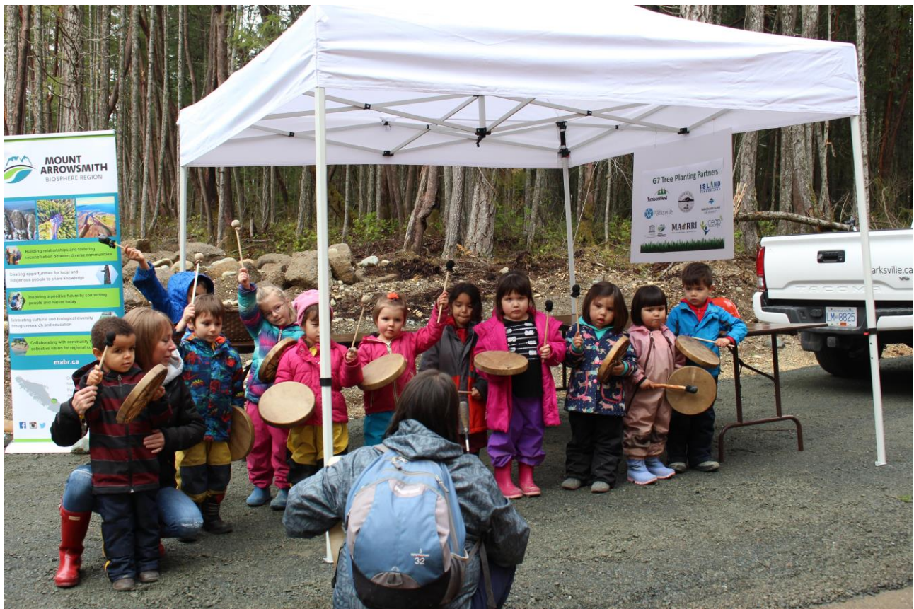
Snaw-naw-as First Nation Preschool children singing “This Land is Your Land” during tree planting at Top Bridge Community Park.